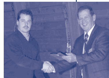
Santiam Fly Casters

The Club of the Year was awarded to the Santiam Fly Casters of Salem for their work on bringing in new Federation members to their club and for their habitat and conservation projects this past year.