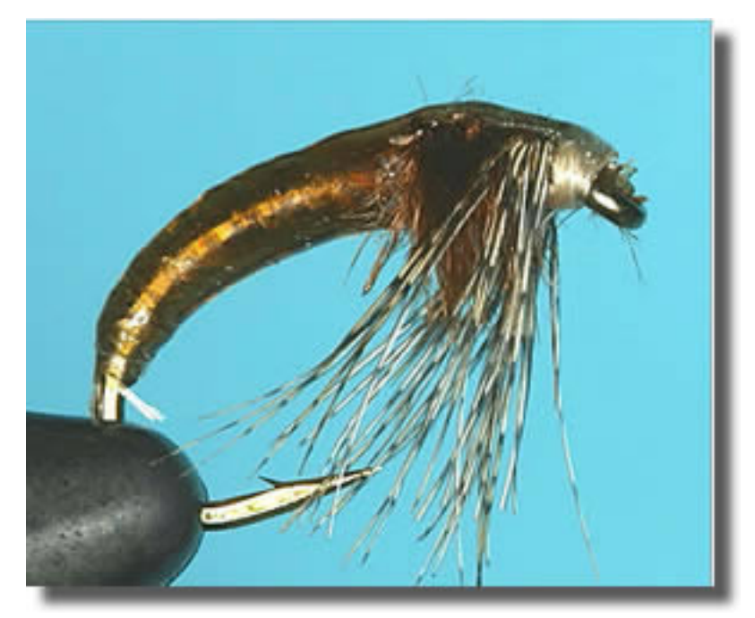
15. Here is a trailer fly that was tied with scud back. Experiment a little with different patterns.

Closing comments: Caddis flies are common in just about all of the streams and lakes worldwide. There are times when a high floating Elk Hair Caddis doesn't do the trick. That is the time to turn to an emerger. The Erv Emerger is a little more complicated to tie, but having a few of them in your fly box can do wonders for your catch rate. So tie a few, and go fishing.