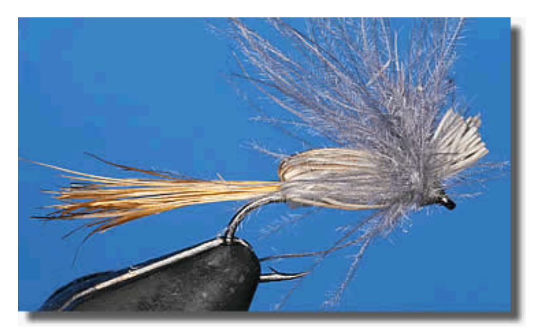
10. Last step cut deer hair at an angle. Trim thread and put glue on threads with a small bodkin so none of the glue gets on the CDC.

9. Pull up the deer hair and wrap in front of deer hair to make a small head. Put a little glue on thread and wind it in.